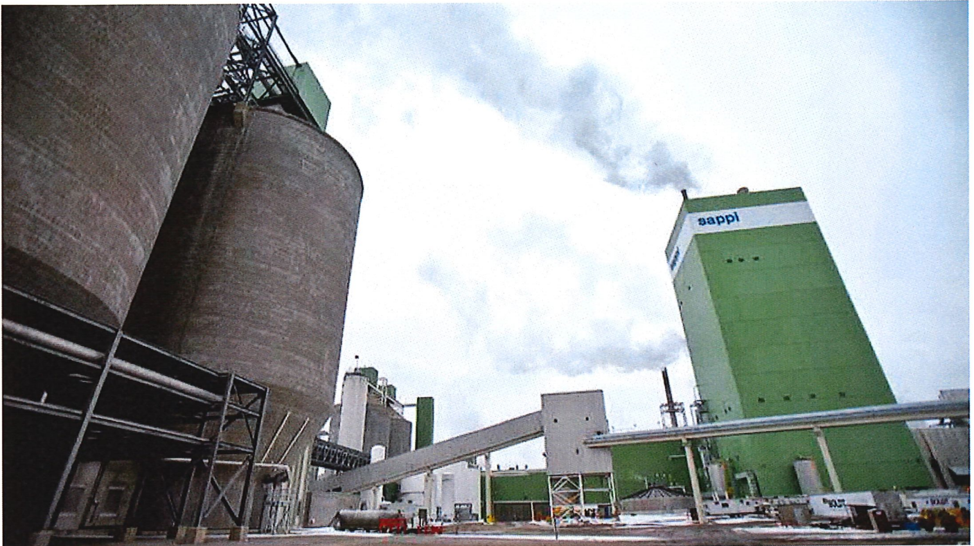
The Sappi Fine Paper North America plant in Cloquet, Minn. (2012 file / News Tribune)

By News Tribune on Nov 14, 2017 at 9:23 a.m.