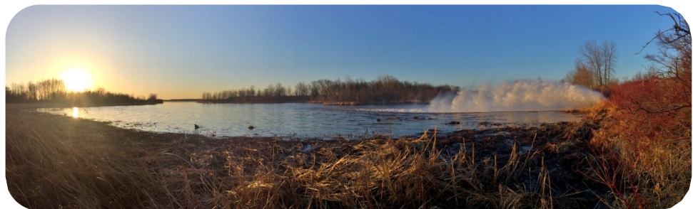
"Morning Bliss on Knowlton Creek"