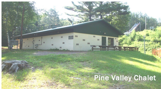
Pine Valley Chalet